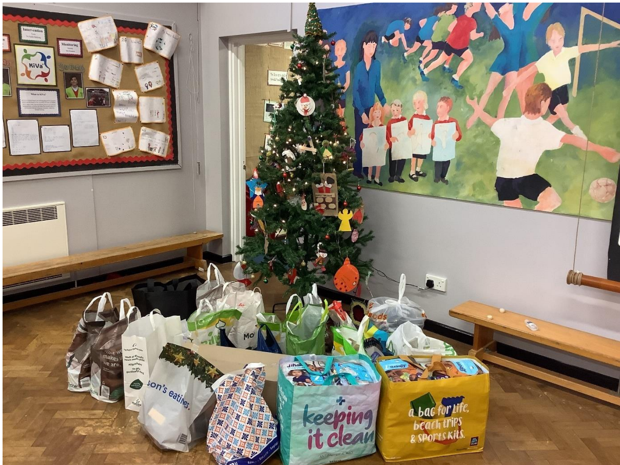
Bendigedig - fantastic!

Your login details will be automatically generated using the prime parents contact information St. Anthony's already has, so please make sure the details we hold for you are up to date. You can check and change these details by sending an email to samail@hwbcymru.net