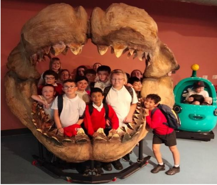
Page 2 of 5